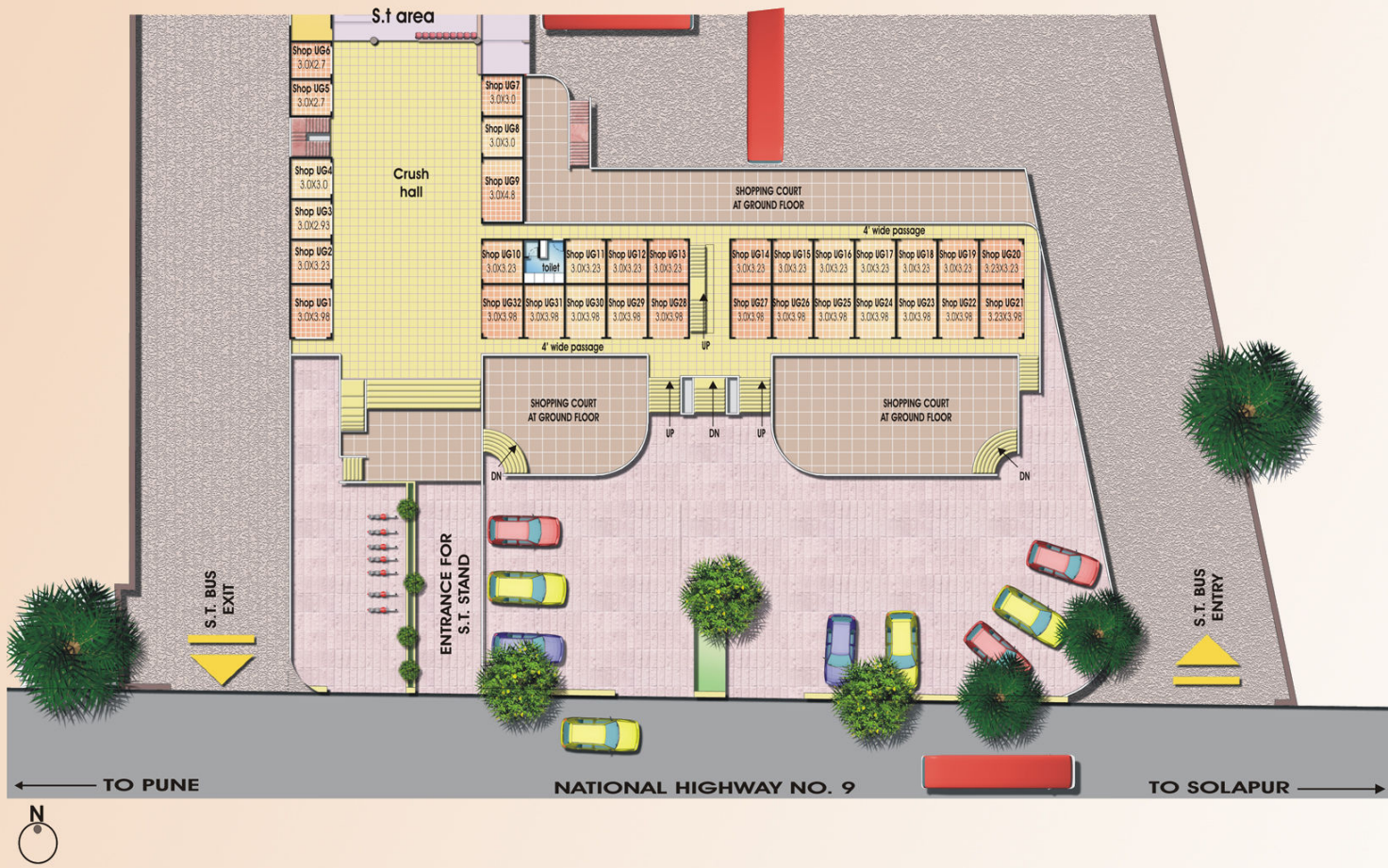
UPPER GROUND FLOOR PLAN